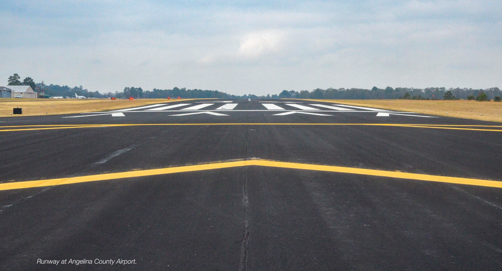
Runway at Angelina County Airport.