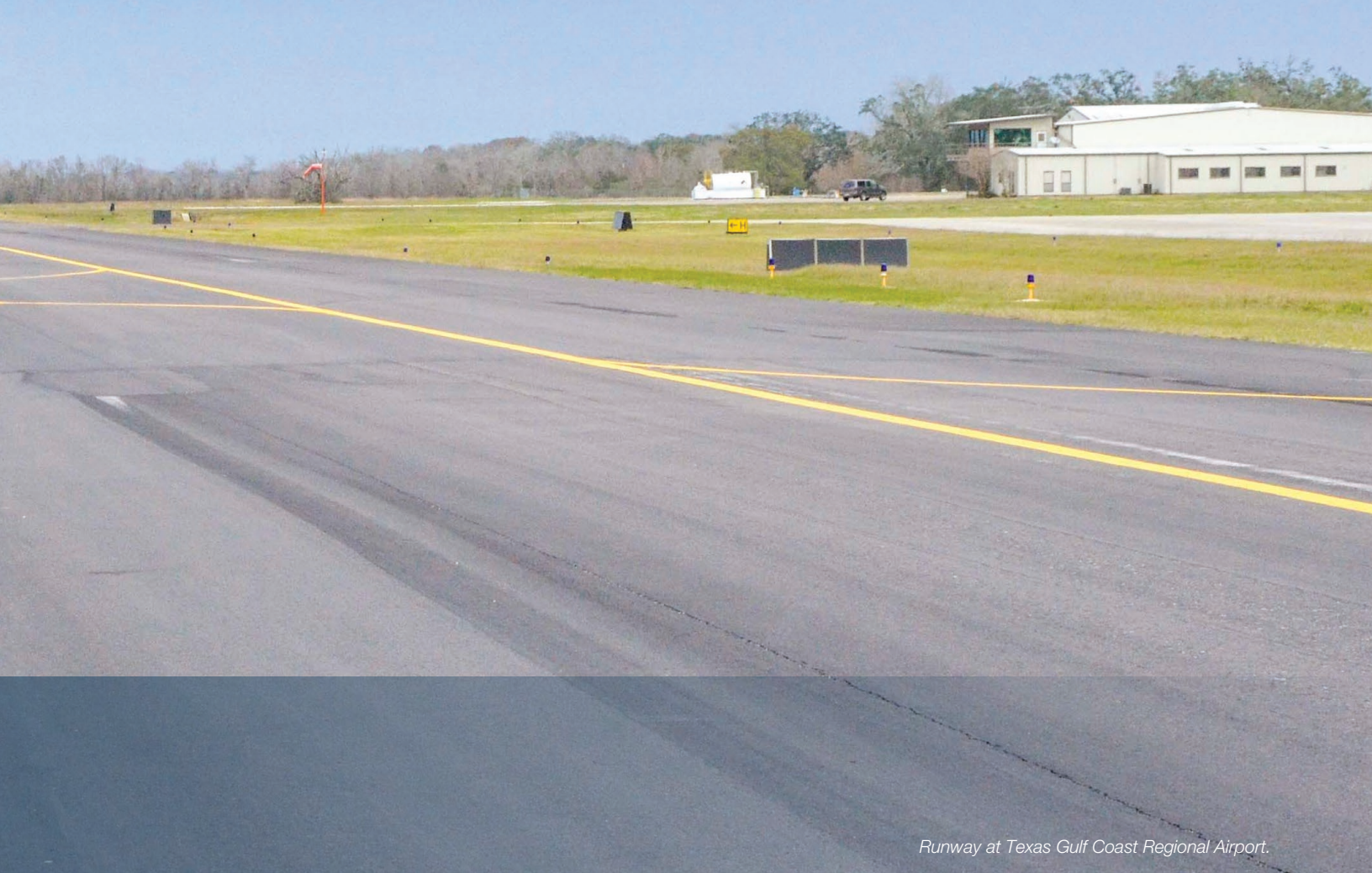
Runway at Texas Gulf Coast Regional Airport.

Being a vital hub of commerce, the airport has undergone many improvements in the past few years including: