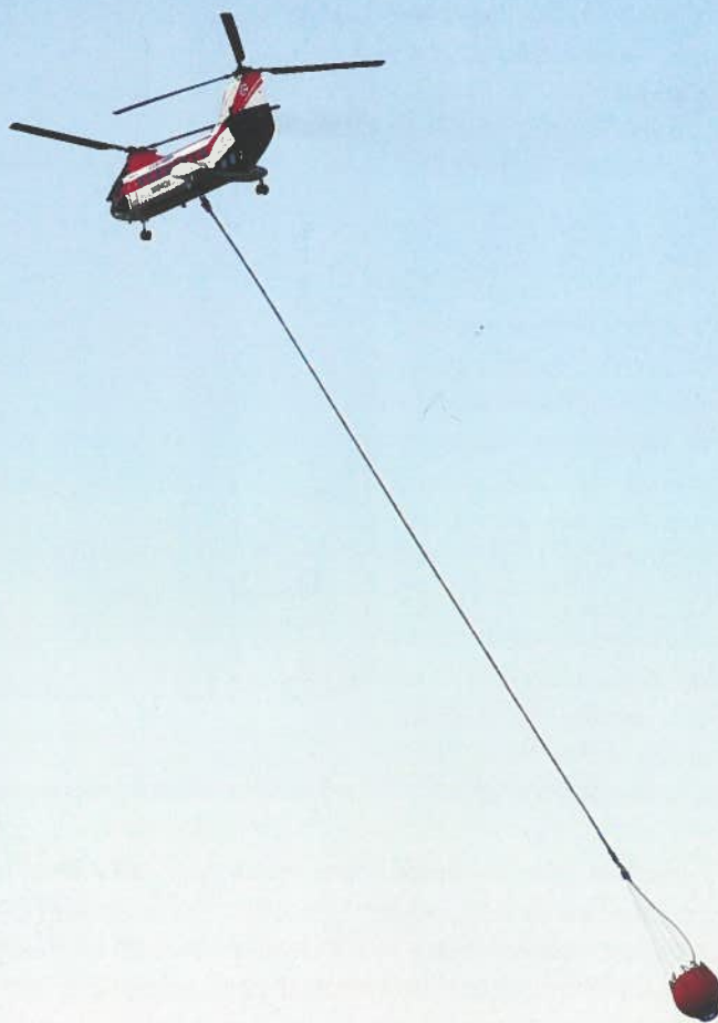
A firefighting helicopter leaves Draughon-Miller Central Texas Regional Airport on its way to drop a load of retardant on a nearby fire.

For the first time, the Texas Forest Service (TFS), which is the state agency responsible for coordinating the firefighting effort, had to utilize the Modular Airborne Fire Fighting System (MAFFS). It consists of C-130 aircraft that each carry 3,000 gallons of water or fire retardant, which can be released on an out-of-control wildfire in just five seconds.