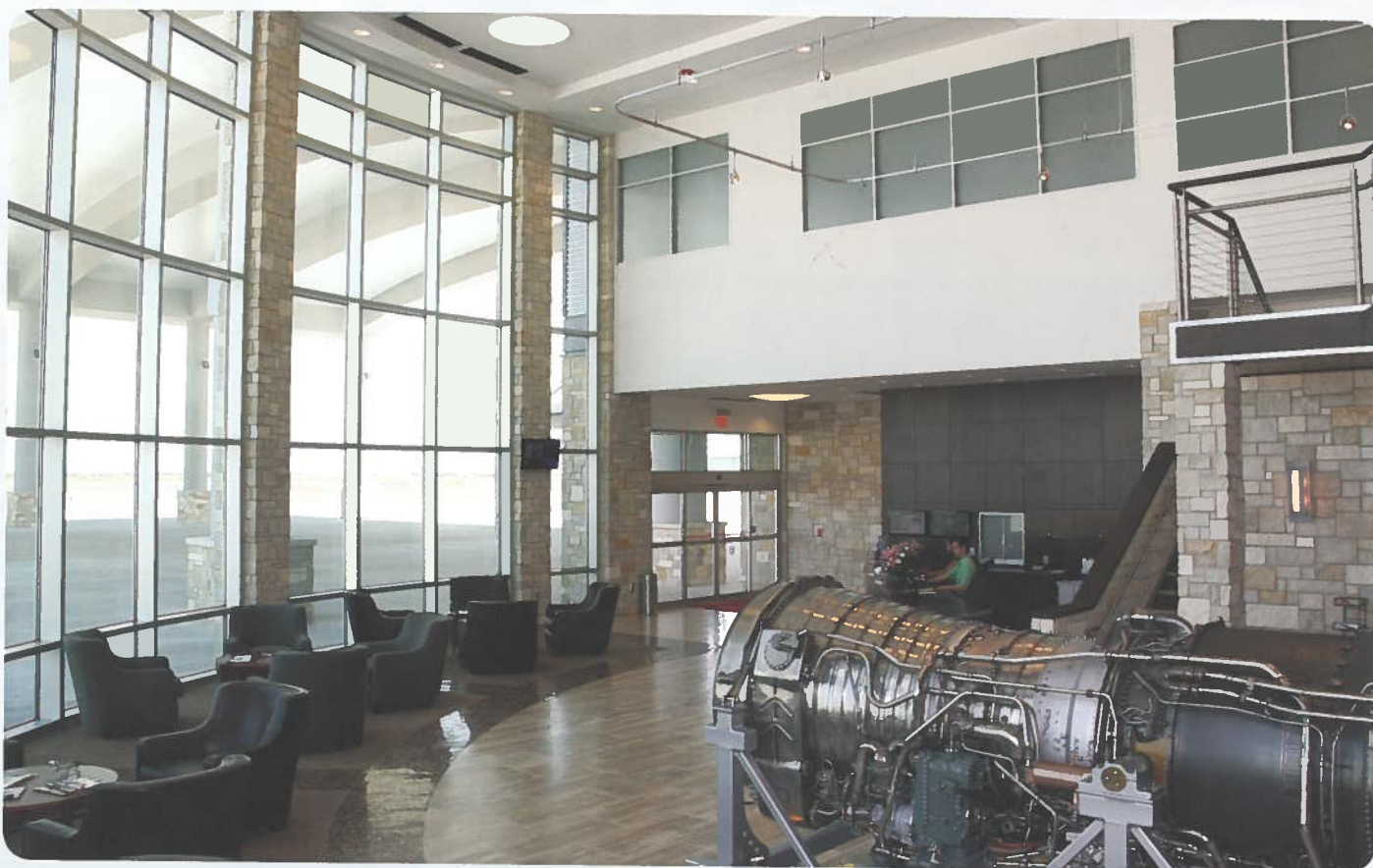
Inside the passenger lobby at Austin Executive Airport, looking over the Rolls Royce Olympus from the Concorde.