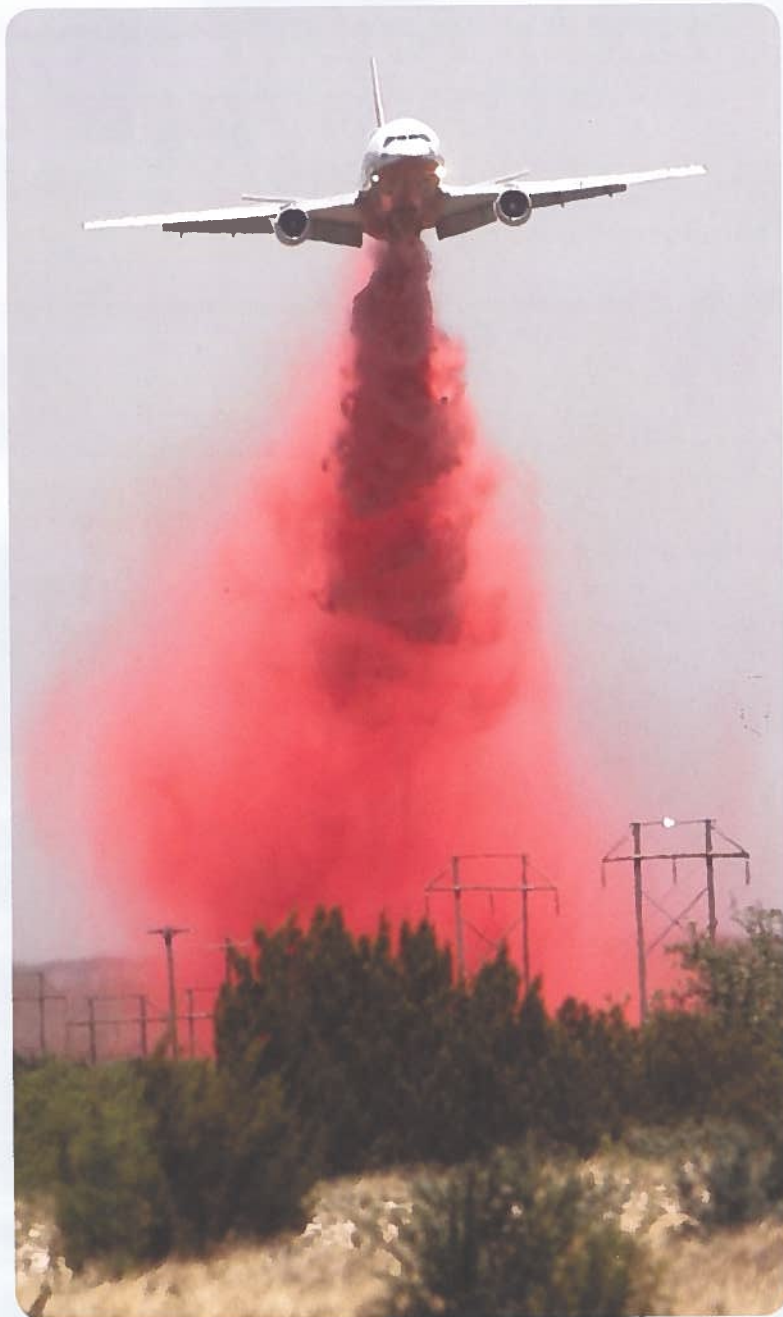
A McDonnell-Douglas DC-10 dumps 12,000 gallons of fire-retardant material in a field near San Angelo. The tanker made three passes, each time having to fly back to Midland to take on a new load.

But looking at the figures, another statistic jumps from the page under the “Homes Saved” column: 3,225. And that’s just for April. For the entire fire season, which typically runs from mid-November through May, the TFS fire-fighting effort is credited with saving more than 9,000 homes and other structures. The fire season usually tapers off in May because of rain, but not this year. The drought persisted and in June some of the largest fires in recent history for central and east Texas occurred in Grimes, Polk and Trinity counties.